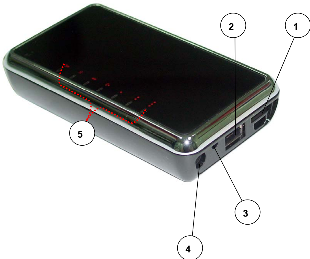
Fig. 1 Front View of 3G/EDGE Super Modem/Router

For more related description, please refer to the Section 2.2 and Section 2.2.1.