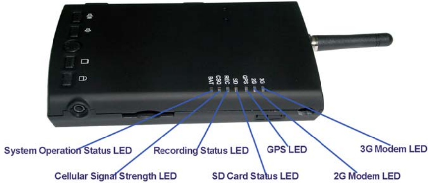
Fig. 1 LEDs on 3G/GPS Camera